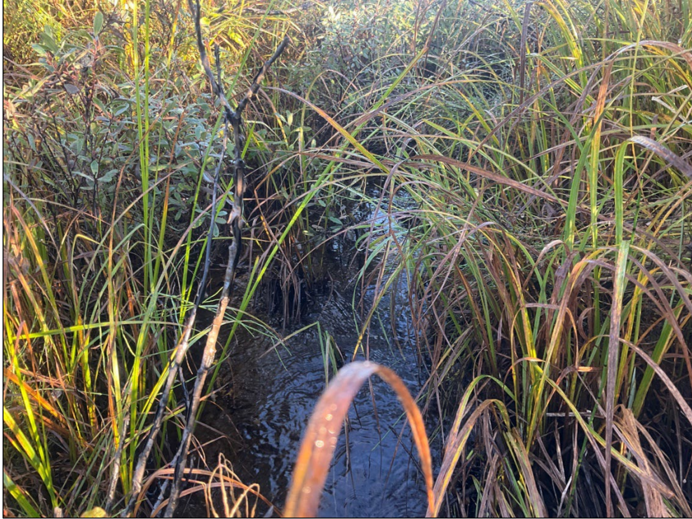
Figure 2.—Channel downstream of the culvert.