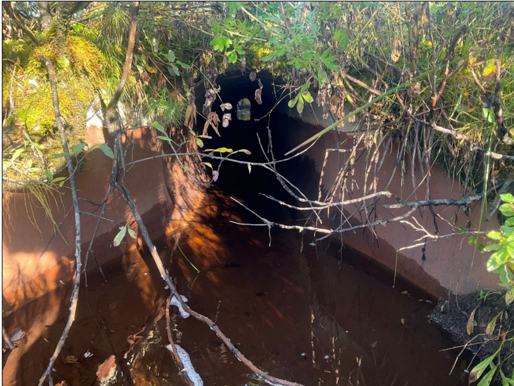
Figure 3.—Culvert downstream of the road.