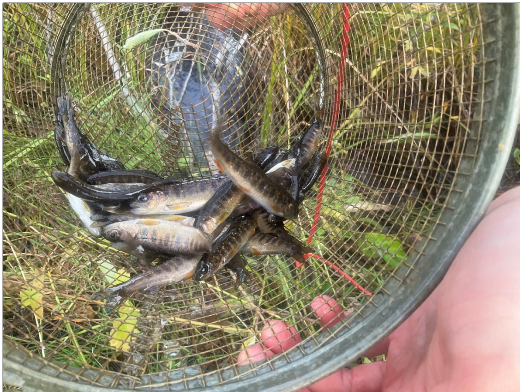
Figure 1.—Juvenile coho salmon and Dolly Varden captured at waypoint 1216